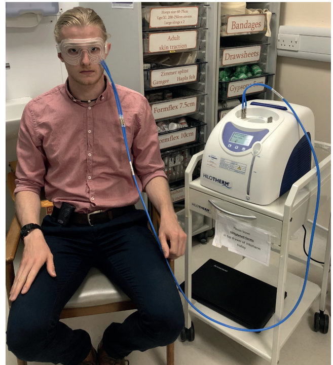
Figure 1. Hilotherm mask setup.

The mask was removed if there was no improvement after the initial 20 minutes of hilotherapy, 40 minutes of total hilotherapy treatment, patient preference, worsening observations or profuse bleeding. Patients' received conventional epistaxis management simultaneously, this involved continued nasal pressure application during hilotherapy. Following hilotherapy if epistaxis continued then either nasal cauterisation or packing was performed. Cessation of epistaxis was determined at the time of packing if bleeding had ceased. Bleeding time was accurately assessed by the recruiting doctor from the time of hilotherm